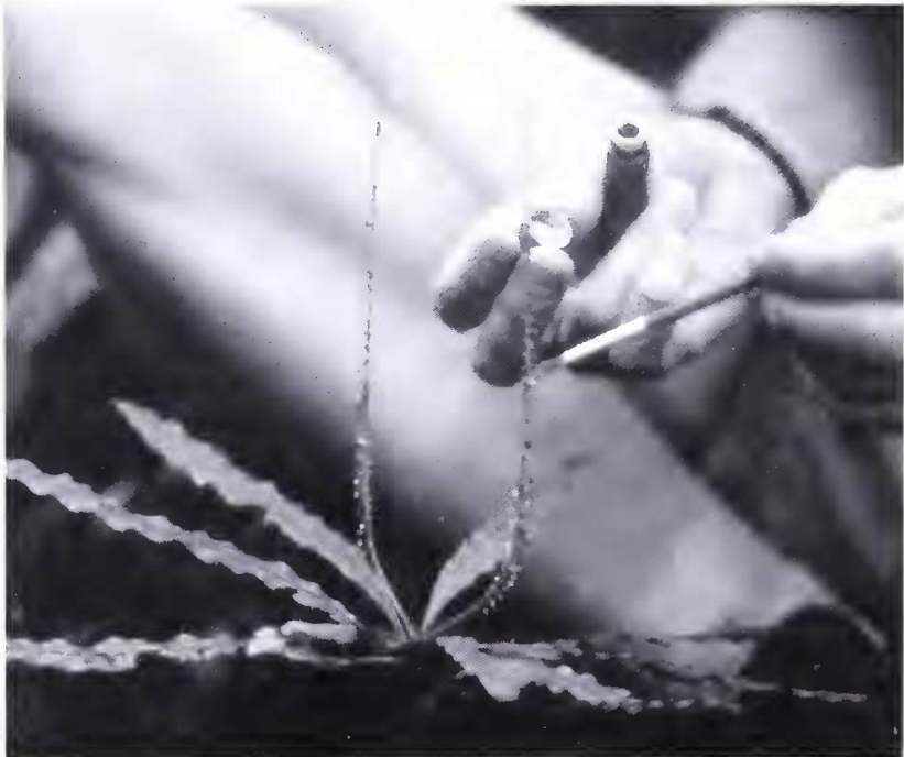
Figure 2: Feeding labelled alanine to a carnivorous plant of T. peltatum in the tropical rain forest in the Parc de Taï (Ivory Coast); interestingly this specimen bears two glandular leaves.